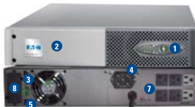
Evolution S 1250 VA