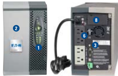
Evolution 850 VA

* Backup times are approximate and may vary with equipment, configuration, battery age, temperature, etc.