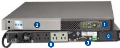
Evolution 650 VA