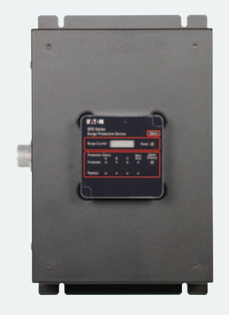
The unit is designed for mounting external to electrical equipment and interfaced via conduit and wires.