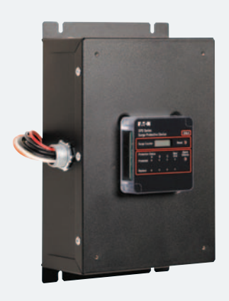
All SPD Series units come prewired and contain a factoryinstalled conduit interface, making installation very easy.