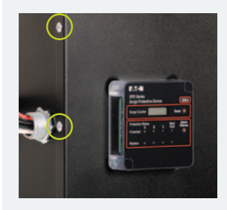
All SPD Series units are factory-sealed, ensuring the user/installer has no potential of coming in contact with hazardous voltages present inside the unit.